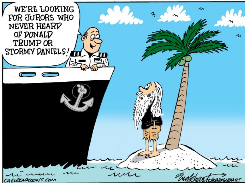
Bob Englehart / Courtesy of Cagle.com