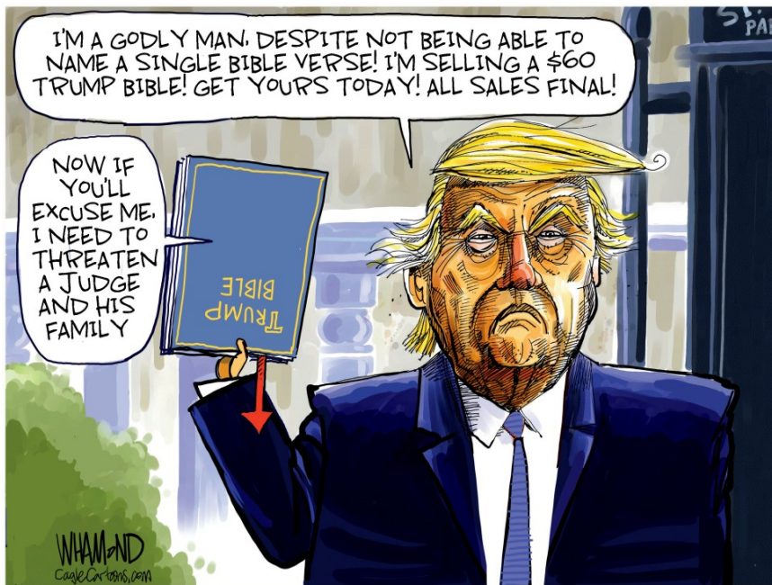
Dave Whamond / Courtesy of Cagle.com