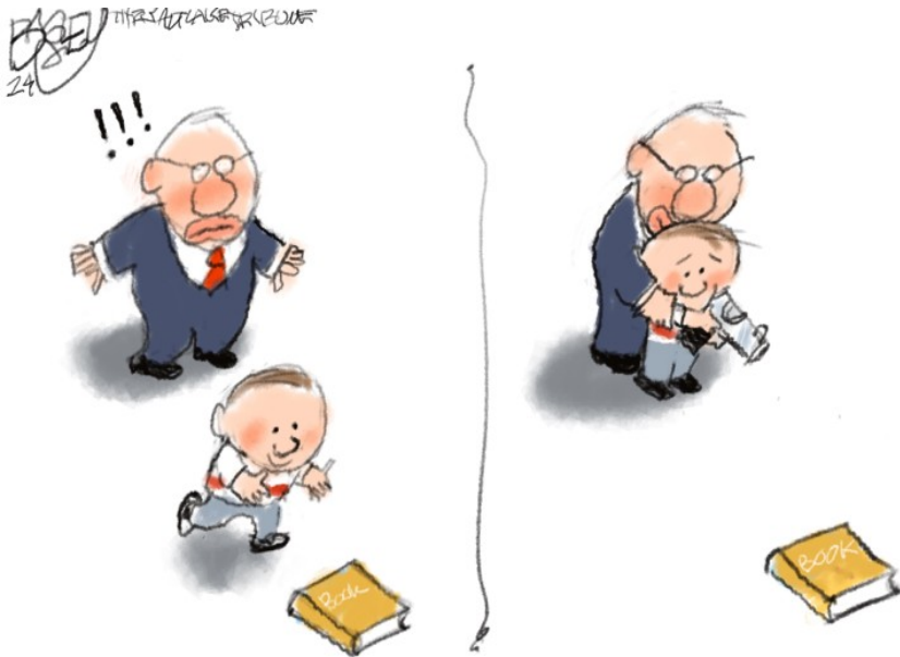
Pat Bagley, Salt Lake Tribune / Courtesy of Cagle.com