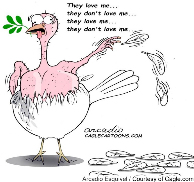
Arcadio Esquivel / Courtesy of Cagle.com