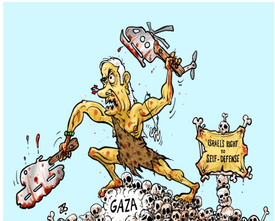
Emad Hajjai, Alaraby Aljadeed Alghad / Courtesy of Cagle.com